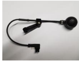
Spare Boom Microphone for Headset

Industrial Plugbox & Cable for Headset with PTT