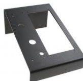
DUAL DESK STAND