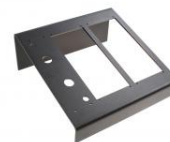
TRIPLE DESK STAND