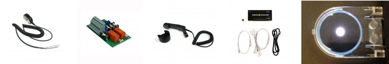
EMMAI-2H Item number: 1023533312 TA-10 Item number: 1008140100 TA-23 Item number: 1008140230 EPIPR-6 Item number: 1023697006 EGA-1 Item number: 1023594100