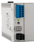
POWER SUPPLY 100-240VAC/24VDC 4A